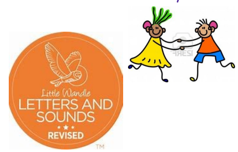
Little Wandle Phonics

We will be learning the following digraphs / trigraphs: ai / ee / igh / oa / oo / oo / ar / or / ur / ow / oi / ear / air / er